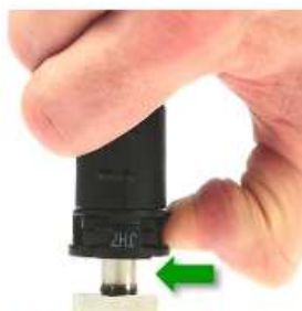
Fig. 23: Pushing in retaining clip 241 N