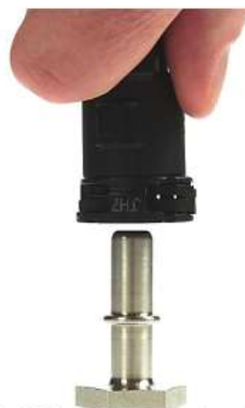
Fig. 32: Centered placement of coupling 241 N-SL above male connector (subsequent assemblies)

Place coupling centered above male connector.