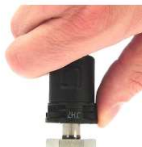
Fig. 16: Activated secondary lock