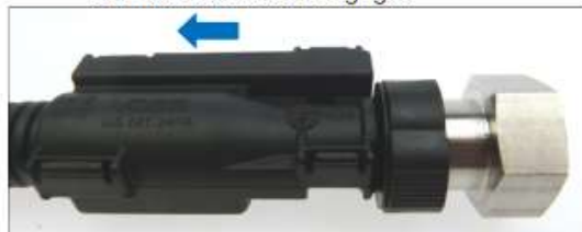
Fig. 3: Checking the correct locking by pulling back the plug