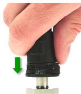
Fig. 22: Pushing down coupling 241 N-SL