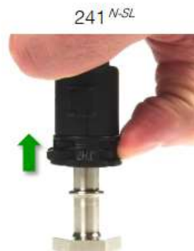
Fig. 26: Pulling off detached coupling 241 N-SL

... until coupling and male connector are completely disconnected.