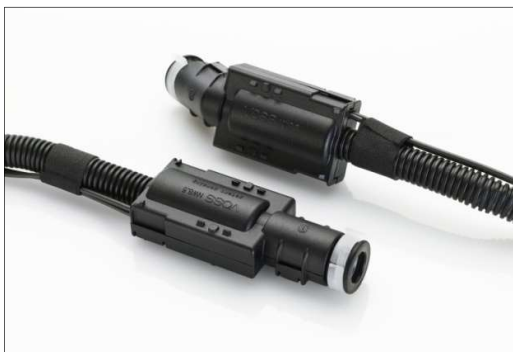
Fig. 1: VOSS quick connect system 241