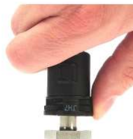
Fig. 37: Activated secondary lock (subsequent assemblies)