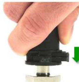
Fig. 35: Until stop plugged coupling 241 N-SL (subsequent assemblies)