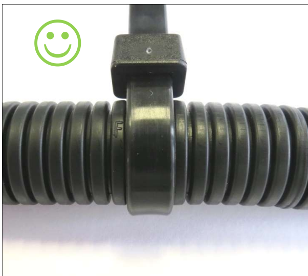
Fig. 4: Correct use of a plastic zip tie