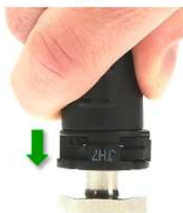
Fig. 21: Pushing down coupling 241 N