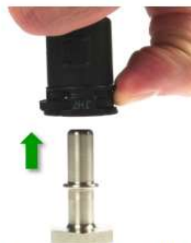
Fig. 28: Disconnection of coupling 241 N-SL and male connector