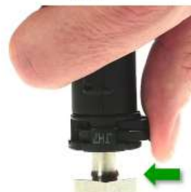
Fig. 15: Activation of secondary lock