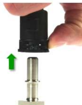
Fig. 27: Disconnection of coupling 241 N and male connector

... until coupling and male connector are completely disconnected.