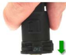
Fig. 33: Plugging of coupling 241 N-SL onto male connector (subsequent assemblies)