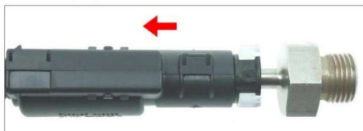
Fig. 6: Pulling back the coupling to the locked position