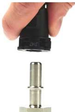
Fig. 8: Centered placement of coupling 241 N above male connector

Place coupling centered above male connector.