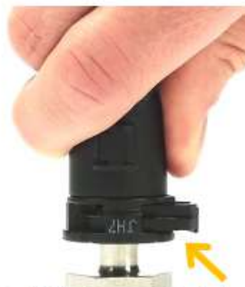
Fig. 34: Visual connection indicator for subsequent assemblies