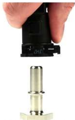
Fig. 9: Centered placement of coupling 241 N-SL above male connector