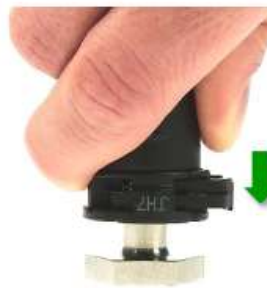
Fig. 14: Until stop plugged coupling 241 N-SL