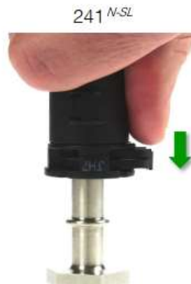
Fig. 11: Plugging of coupling 241 N-SL onto male connector

Only 241 N-SL : Retaining clip with secondary lock cannot be activated in this position.