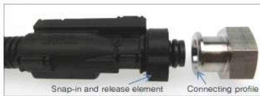
Fig. 1: Plug and connecting profile before assembly