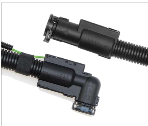
Fig. 3: VOSS quick connect system 241 N/N-SL