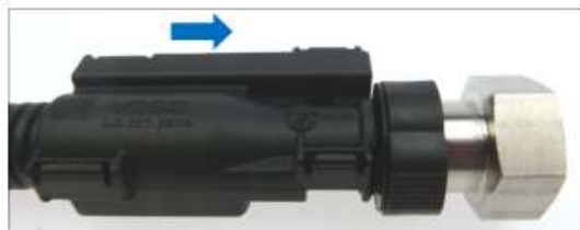
Fig. 2: Pushing the plug as far as it will go onto the connecting profile; in the process the snap-in and release element engages