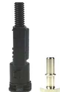
Fig. 29: Completely disassembled coupling 241 N with male connector

Only 241 N-SL : Retaining clip with secondary lock is flush with clip cage.