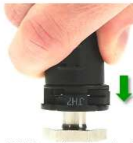
Fig. 13: Until stop plugged coupling 241 N

Plug coupling onto the male connector until it stops.