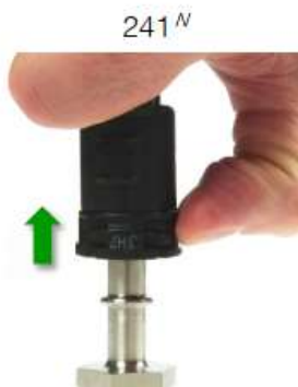
Fig. 25: Pulling off detached coupling 241 N