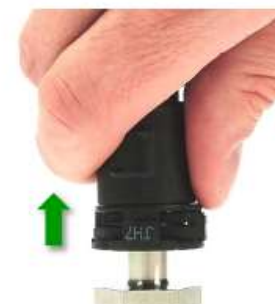
Fig. 38: Retracting of connected coupling 241 M-SL (subsequent assemblies)