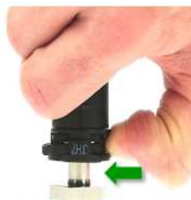
Fig. 24: Pushing in retaining clip 241 N-SL