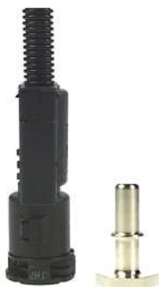
Fig. 6: Separated coupling 241 N and male connector