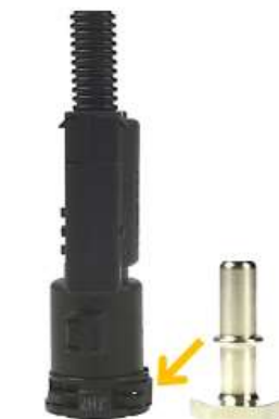
Fig. 30: Completely disassembled coupling 241 N-SL with male connector