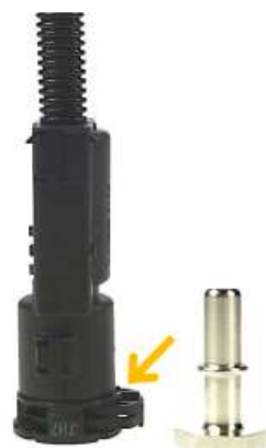
Fig. 7: Separated coupling 241 N-SL and male connector