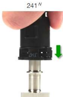
Fig. 10: Plugging of coupling 241 N onto male connector