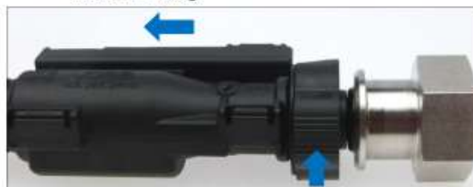
Fig. 5: Pressing the snap-in and release element and pulling off the plug