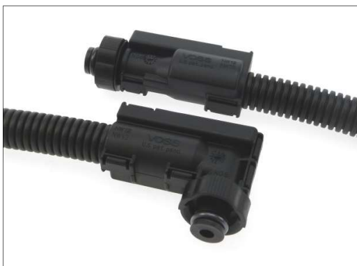
Fig. 2: VOSS quick connect system 246 NX