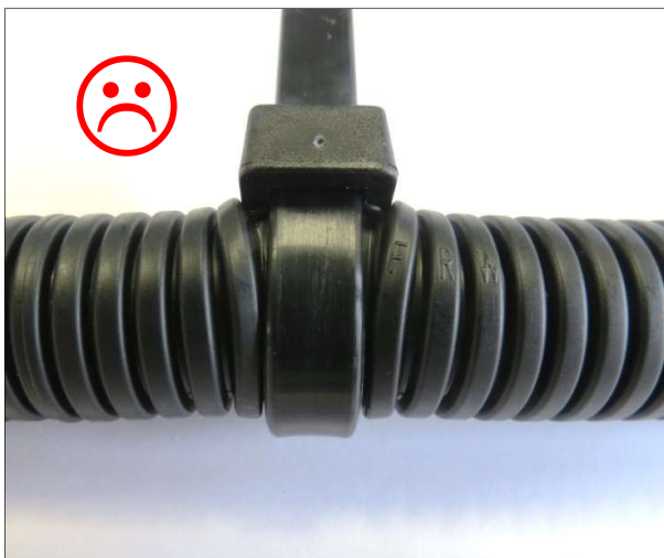
Fig. 5: Incorrect use of a plastic zip tie

The line assemblies must have additional clipping or support points. The line should be supported every 500 mm along the length. The recommended means of clipping is a metal P-clamp that has a rubber protective coating on it. The clamp should not be allowed to damage the corrugated tube.