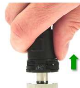
Fig. 18: Retracting of connected coupling 241 N-SL