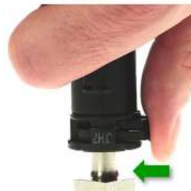
Fig. 36: Activation of secondary lock (subsequent assemblies)