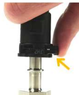
Fig. 12: Blocked secondary lock

Only 241 N-SL : Retaining clip with secondary lock cannot be activated in this position.