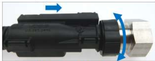
Fig. 4: Pushing the plug in the connection direction for disconnecting