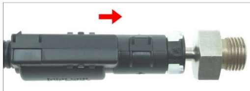
Fig. 5: Pushing the coupling as far as it will go onto the male connector; in the process the holding clip engages