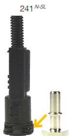
Fig. 31: Disconnected coupling 241 N-SL and male connector (subsequent assemblies)

Coupling with flush retaining clip with secondary lock and male connector are separated (starting situation).