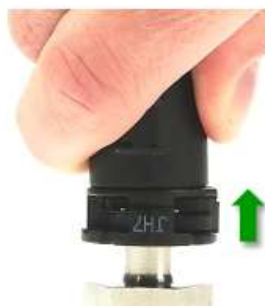
Fig. 17: Retracting of connected coupling 241 N

Slightly retract coupling, until it reaches the collar of the male connector.