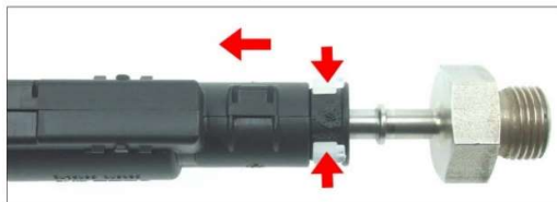
Fig. 8: Compressing the lugs of the holding clip and pulling the coupling off