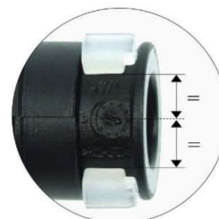
Fig. 4: Holding clip in centered position

Before assembly the components have to be checked. They must be clean and should not show any signs of damage.