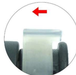
Fig. 9: System not locked (see also figs. 5 and 7); pull the coupling back in the indicated direction for locking the system.

The coupling is pushed onto the male connector to the limit stop. The holding clip of the coupling engages behind the bead of the male connector.