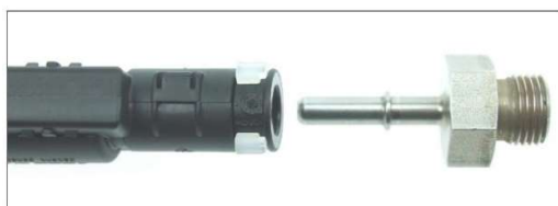
Fig. 3: Coupling and male connection before assembly