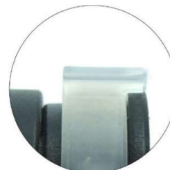
Fig. 10: System locked (see also fig. 6)

Moving the coupling in the initial pushing direction causes the holding clip to leave the locked position. The lugs of the holding clip can be compressed and the coupling can be pulled off the male connector.